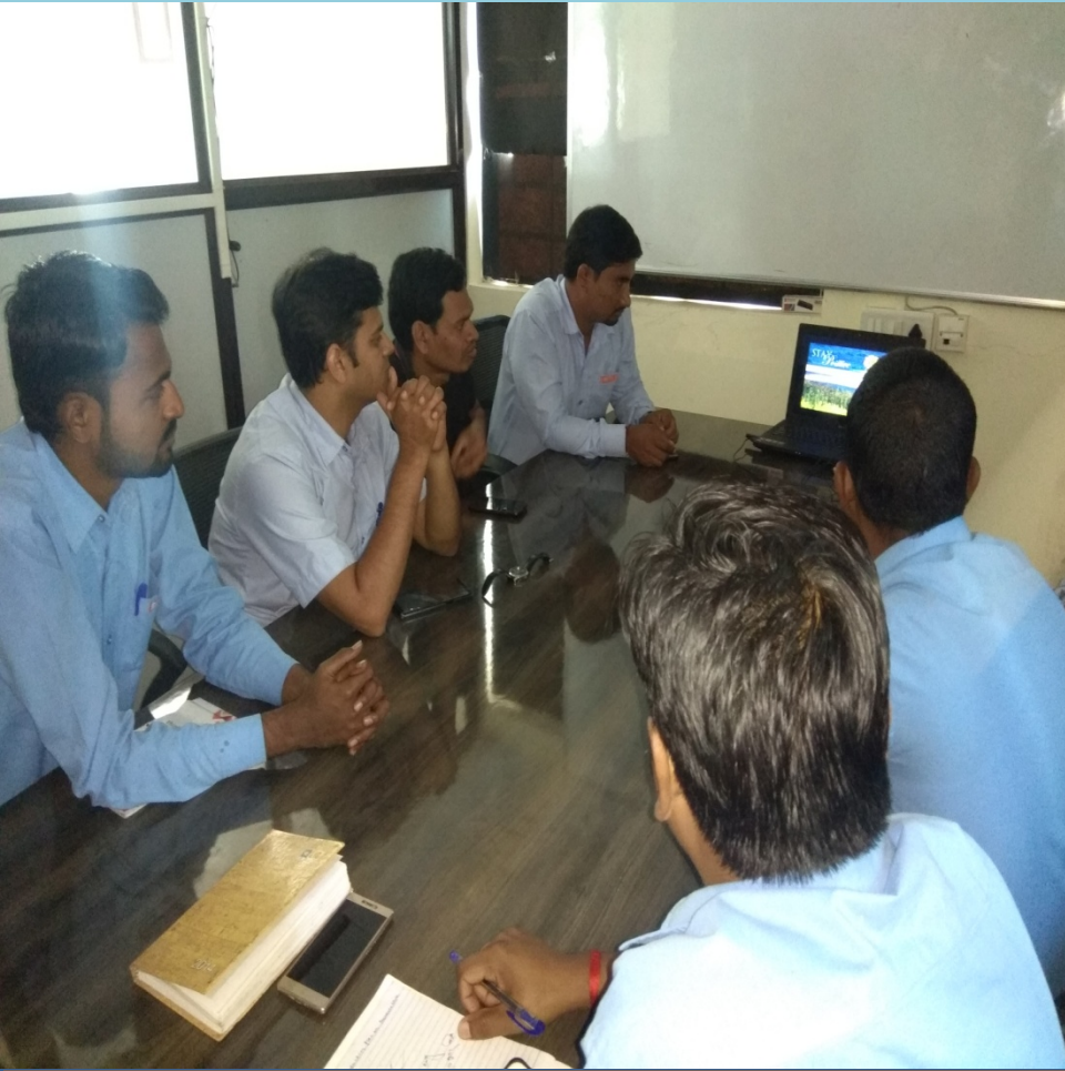
Conference hall training for department Head