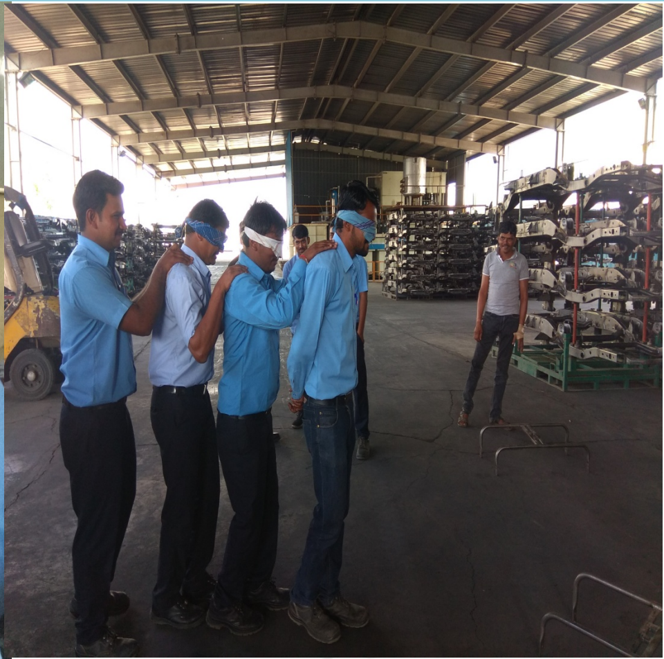
Team Building activity for employee